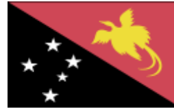
Papua New Guinea