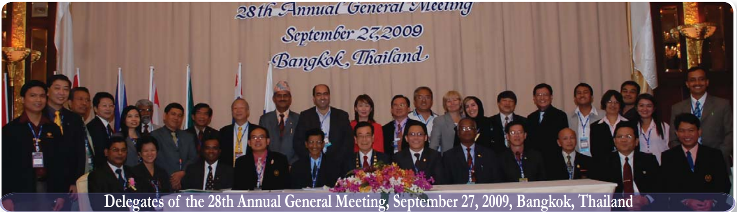
Delegates of the 28th Annual General Meeting, September 27, 2009, Bangkok, Thailand