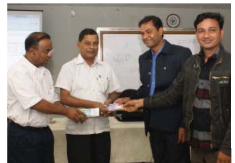
The Chairman and Manager of a credit union hand over Tk. 50,000 (US$625) as initial payment for CCULB's technical assistance on ACCESS.

Eight credit unions are accredited under Bronze ACCESS Brand - 3 from the Philippines and 5 from Nepal. CCULB is hope for its 10 credit unions undergoing accreditation.