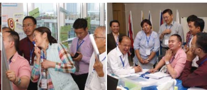
27 credit union experts from 11 countries (Bangladesh, Bhutan, Cambodia, India, Indonesia, Mongolia, Myanmar, Nepal, Philippines, Sri Lanka, and Thailand)