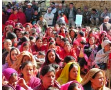
6 - 4th South Asian Sub-Regional Workshop, Nepal