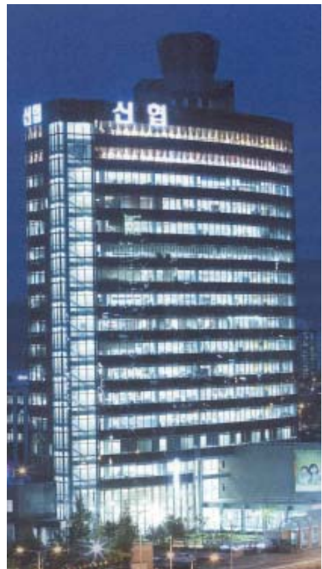
NACUFOK Headquarter Daejeon City, Korea

NACUFOK now represents 1,007 credit unions with total membership of 4.79 million. The movement assets has grown to 27.4 trillion Korean Won or US$ 27.4 billion.