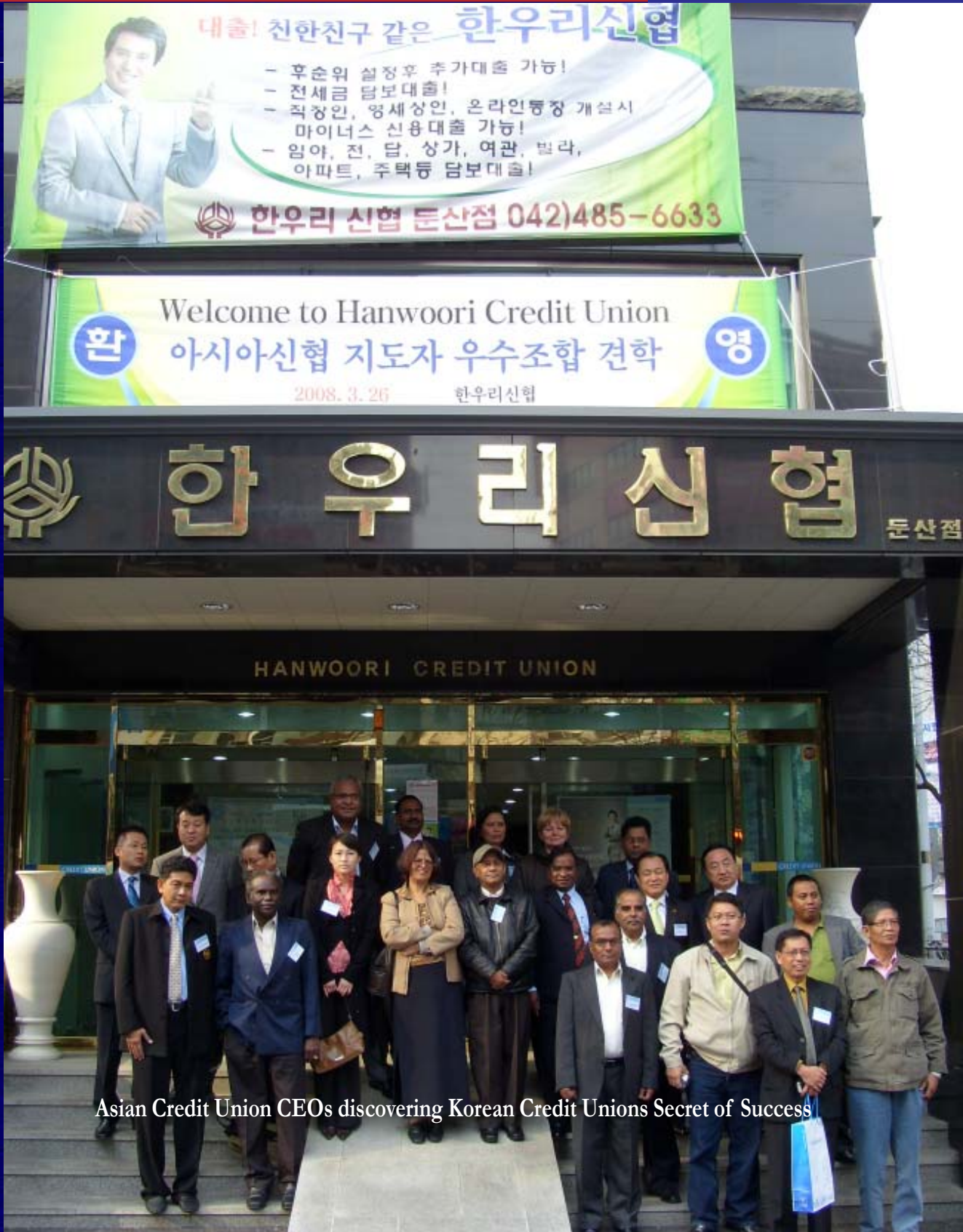
Asian Credit Union CEOs discovering Korean Credit Unions Secret of Success