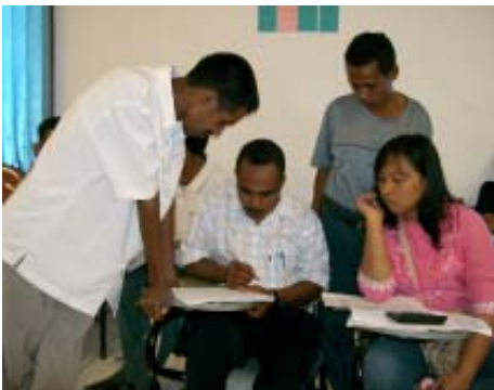
8 - Timor Leste: Reaching Out Countries- CU needed most