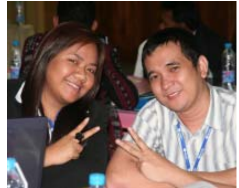
7 - 2nd CULT Exposure Program