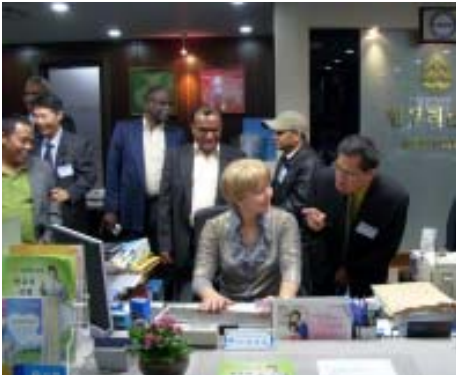
4 - Asian CEOs Inspired by NACUFOK Achievements

The Association of Asian Confederation of Credit Unions operates as a regional representative organization of credit unions and similar cooperative financial institutions in the region of Asia. ACCU is representing 34.9 individual members from 49,176 credit unions in 23 countries in Asia. ACCU works in partnership with its member organizations [apex body of credit unions] to promote and strengthen credit unions as vehicles of community development and socioeconomic development of people.