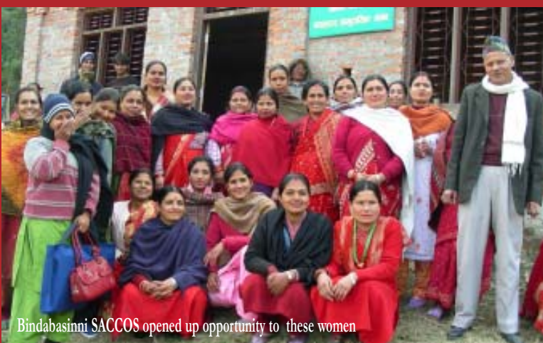
Bindabasinni SACCOS opened up opportunity to these women