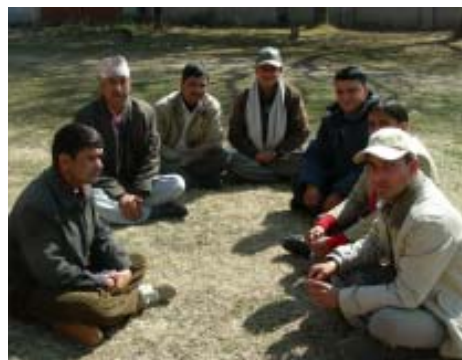
9 - Coop Dept. Officer in Nepal Hone Skills on PEARLS