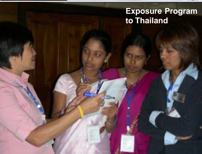
Exposure Program to Thailand

Credit Unions Renewed Commitment to World's Biggest Promise - MDGs