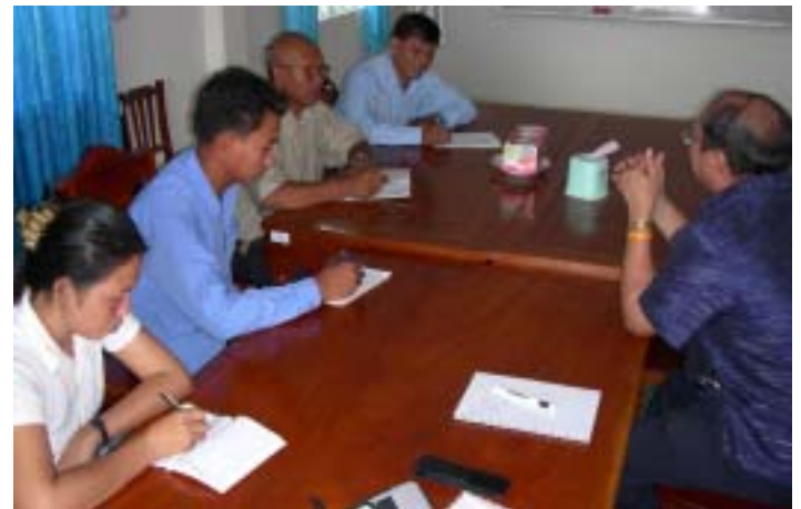
Consultation meeting with CCSF (Cambodia) Board of Directors in February 2007

During the last three months, I had the opportunity having several meetings with the management to learn ACCU