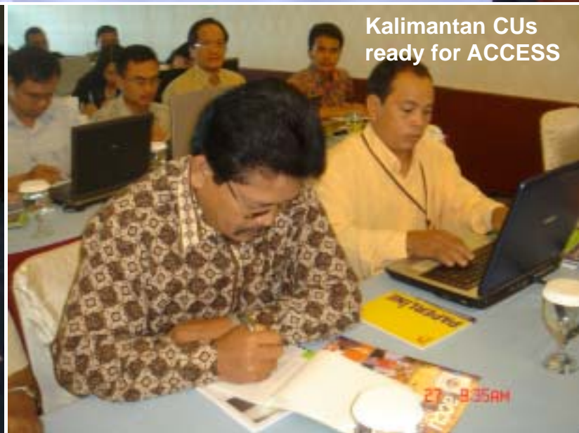
Kalimantan CUs ready for ACCESS