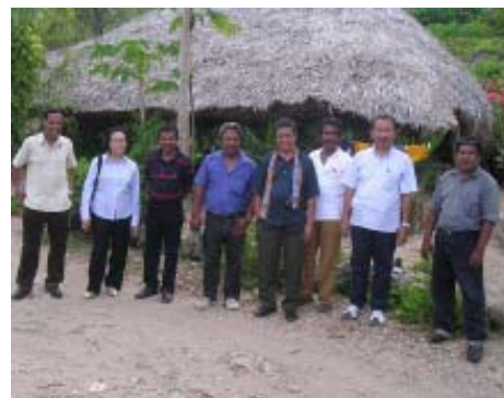
6 - Timor Leste, Rebuilding Lives through CUs