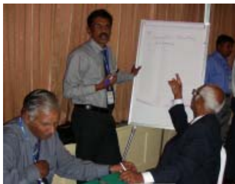
4 - Regional CUDCC Held in Bangkok

The Association of Asian Confederation of Credit Unions operates as a regional representative organization of credit unions and similar cooperative financial institutions in the region of Asia. ACCU is representing 34.9 individual members from 49,176 credit unions in 23 countries in Asia. ACCU works in partnership with its member organizations [apex body of credit unions] to promote and strengthen credit unions as vehicles of community development and socioeconomic development of people.