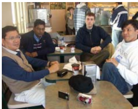
5 - CEOs Explore Canada's CU System