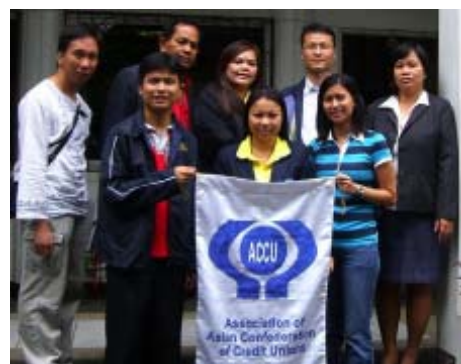
9 - 2nd PFCCO Internship