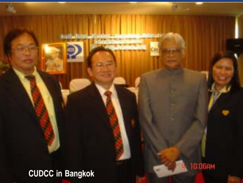
CUDCC in Bangkok