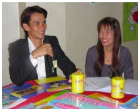
10 - CU Financial Services for Youth Unveiled