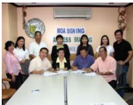
8 - ACCESS MOU Signing in Philippines