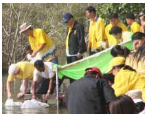
7 - Thai ICU Day: Beyond Message of Solidarity