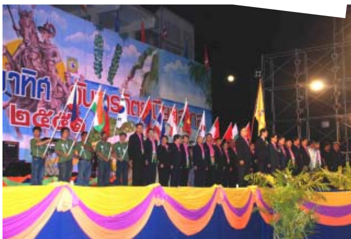
Thai ICU Day Celebration