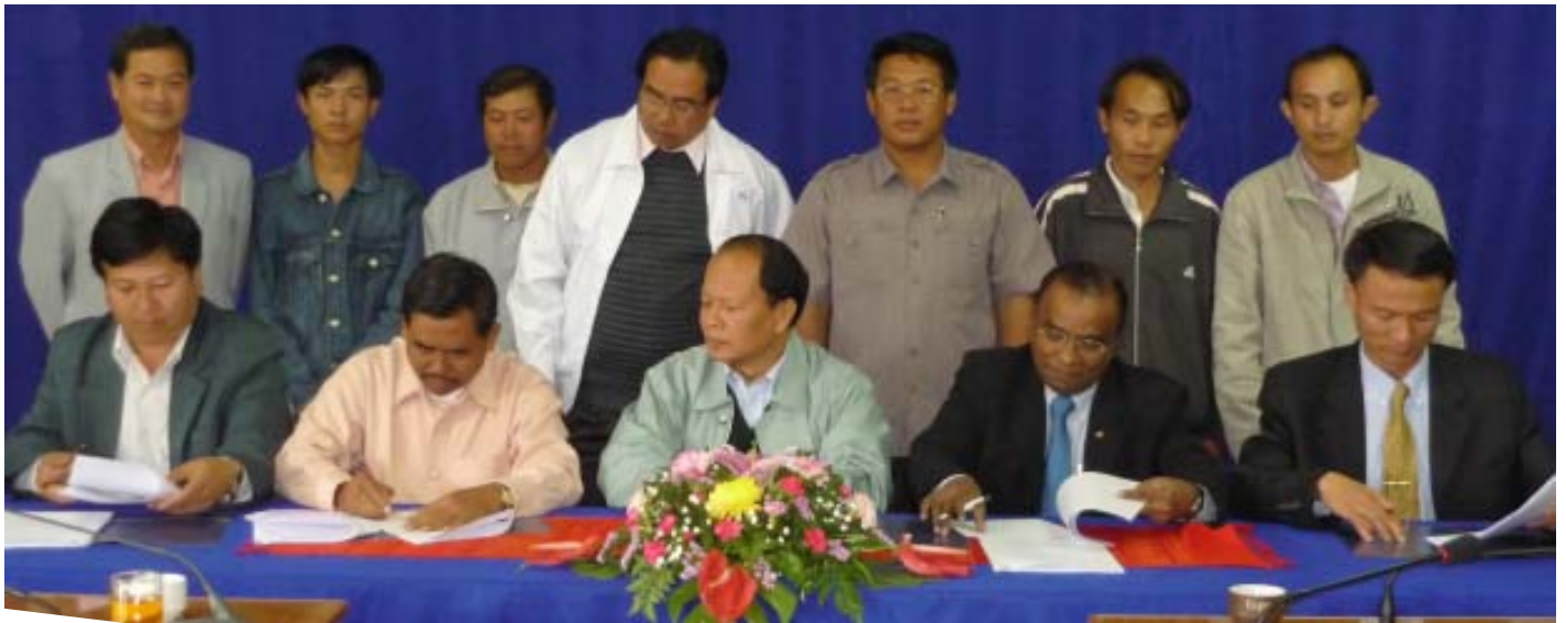
MoU Signing for Laos CU Promotion