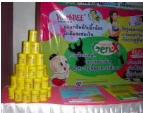
6 - Financial Literacy for Children to be Intensified