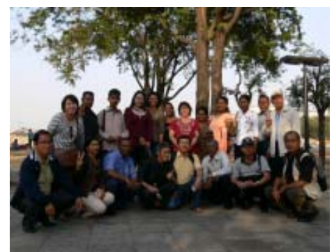
8 - CU Exposure Program Helps to Widen Leaders World View