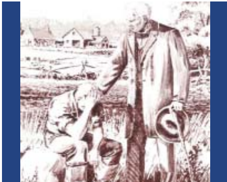
3 - OUTLOOK: The Value of CUs in the Current Global Financial Crisis

The Association of Asian Confederation of Credit Unions operates as a regional representative organization of credit unions and similar cooperative financial institutions in the region of Asia. ACCU is representing 34.9 individual members from 49,176 credit unions in 23 countries in Asia. ACCU works in partnership with its member organizations [apex body of credit unions] to promote and strengthen credit unions as vehicles of community development and socioeconomic development of people.