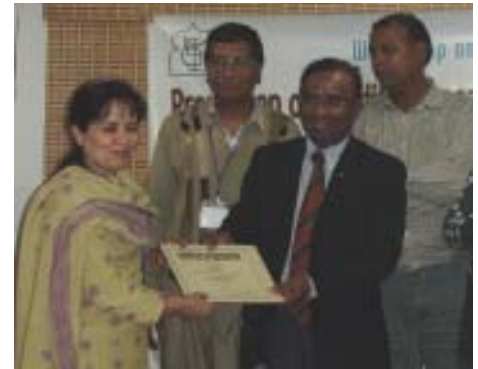
5 - Irish CUs Support CU Promotion in Pakistan