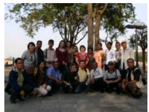
8 - CU Exposure Program Helps to Widen Leaders World View