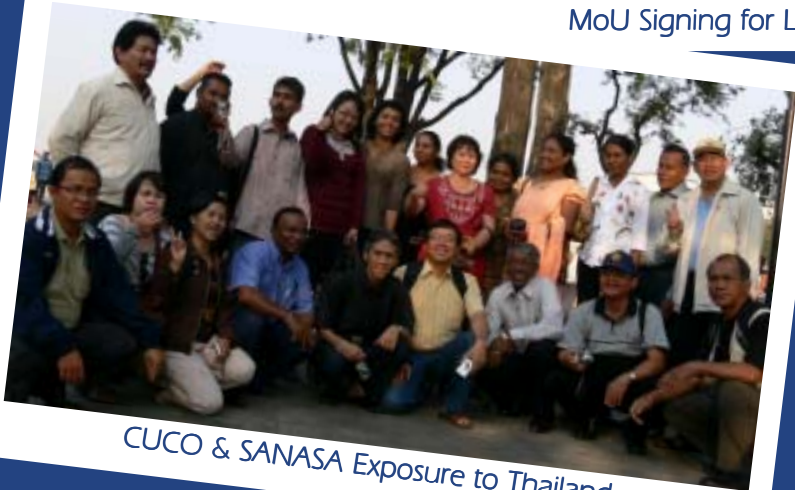
CUCO & SANASA Exposure to Thailand