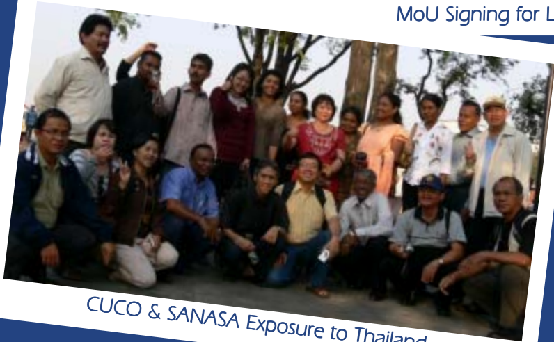
CUCO & SANASA Exposure to Thailand