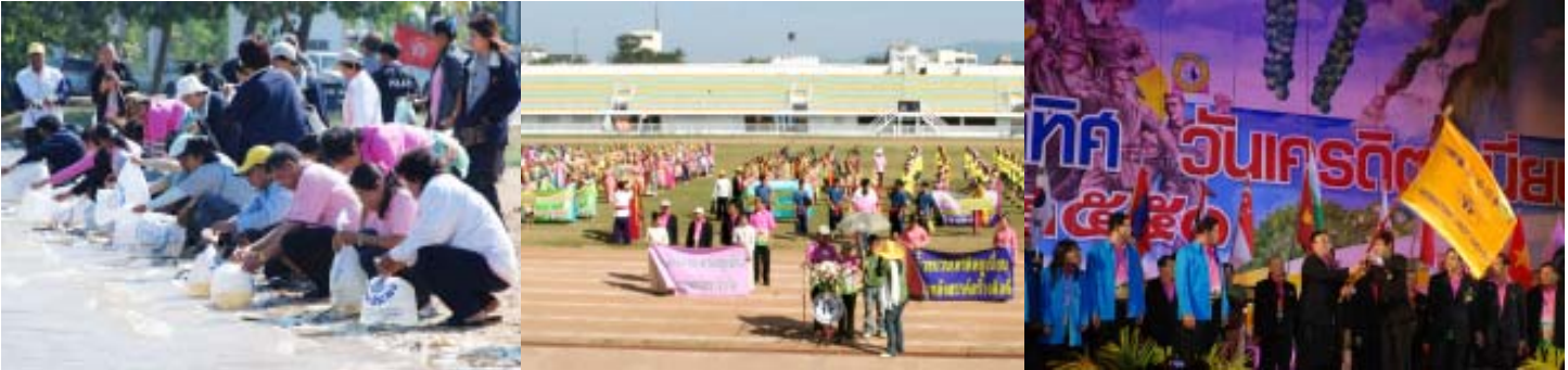
UPRECEDENTED EVENT: (L-R) releasing of 3 million shrimp fingerlings; participants assemble for the credit union parade; and CU leaders of Central Chapter accept the hosting responsibility for ICU Day celebration in 2010

More than 10,000 credit union supporters across Thailand gathered in Chantaburi for the grand celebration of the International Credit Union Day (ICU) on the theme "Reaching Precious World of the East" organized by the Credit Union League of Thailand (CULT) from December 9-13.