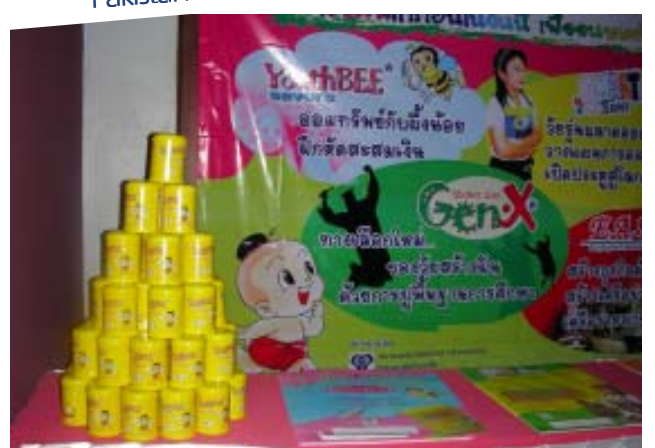
Kids Savings in CUs