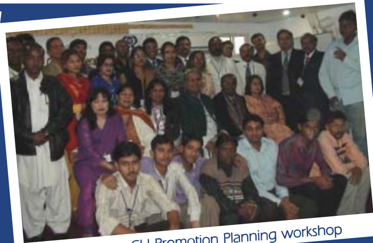
Pakistan CU Promotion Planning workshop