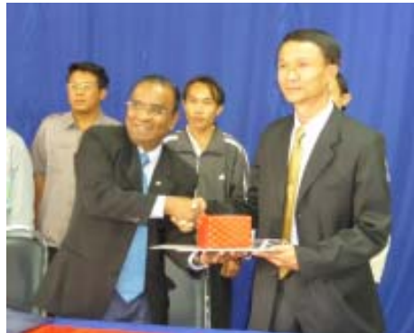
4 - New Agriterra Project to Organize 15 New CUs in Laos