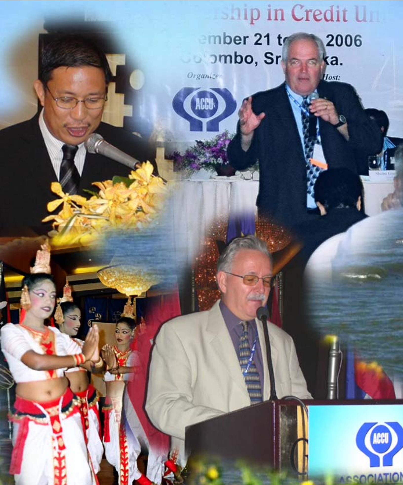
SPEAKERS AND MODERATORS