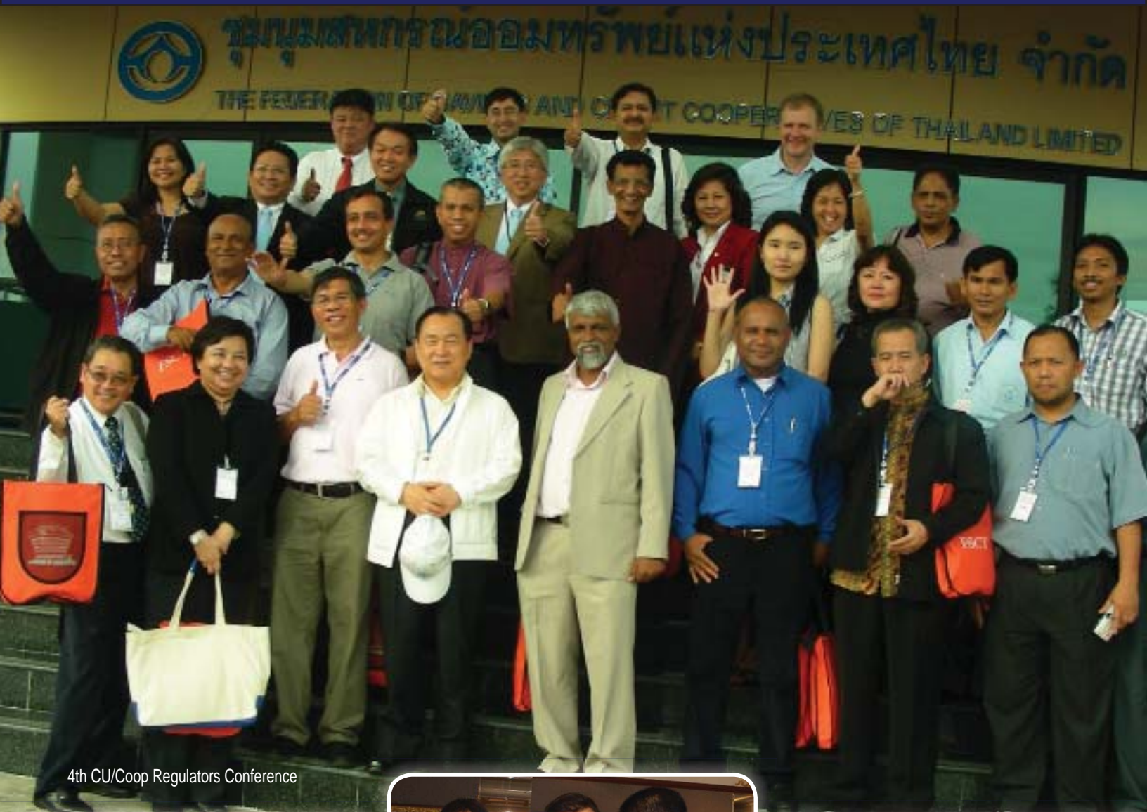
4th CU/Coop Regulators Conference