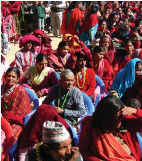
Annual General Meeting in Bhindavasini SACCO (Nepal): Cooperatives emerged to help poor households escape the debt trap and provide access to better quality goods and services.

Theme: “Driving Global Recovery through Cooperatives”