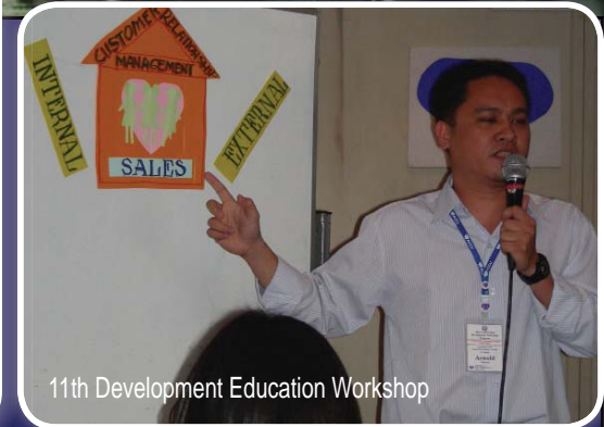
11th Development Education Workshop